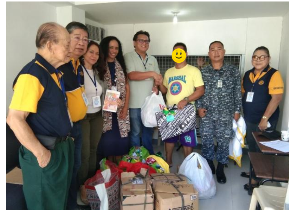
Turnover of gifts to the inmates of Maa City Jail. Jan. 17, 2020